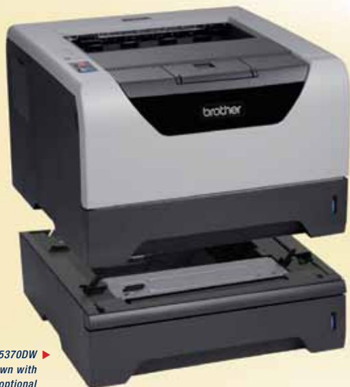
HL-5370DW shown with optional paper tray*

The HL-5370DWT includes all the features of the HL-5370DW plus adds a 2nd lower paper tray as standard. This model is ideal for users that need the features of the HL-5370DW, but want additional paper capacity including the flexibility to store and use letter and legal size paper.